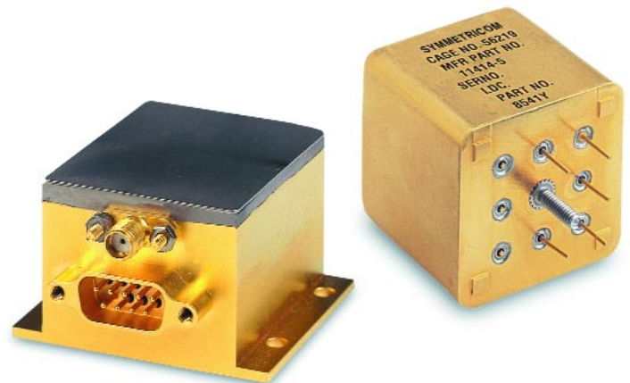
9700 Aerospace Oscillators Series